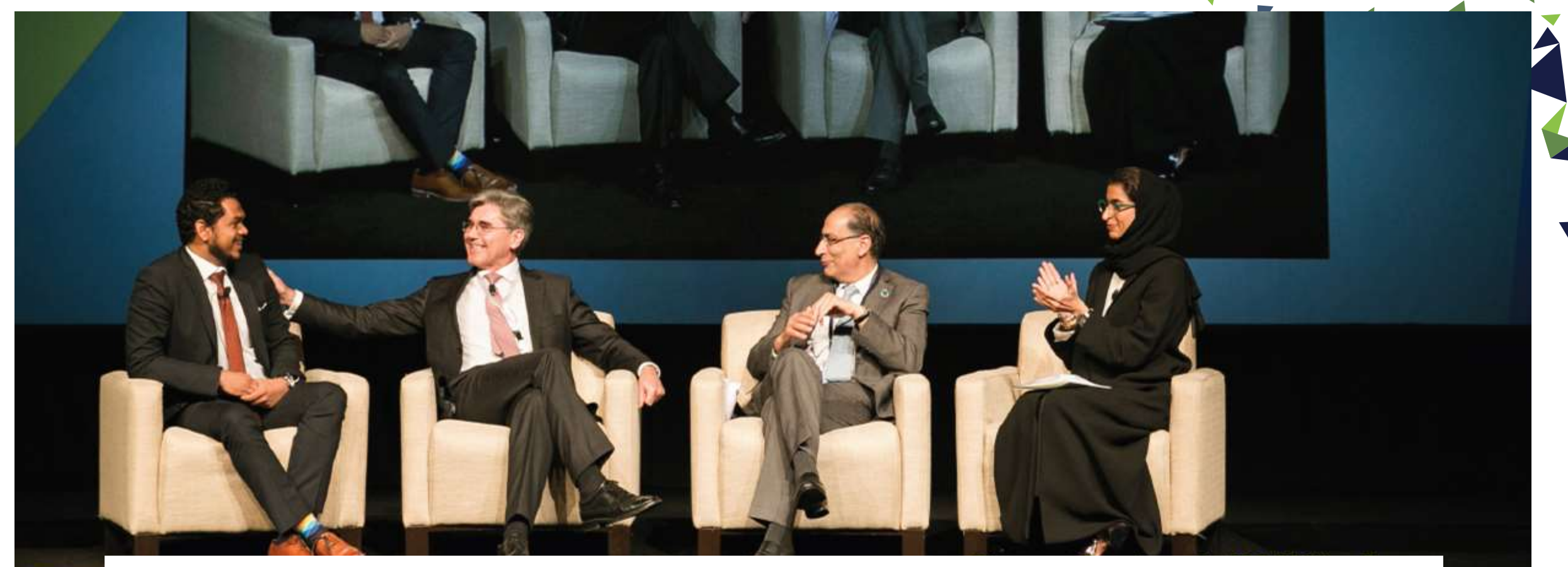
Siemens CEO grants €100m in software licenses to UAE universities